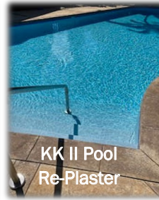
KK II Pool Re-Plaster