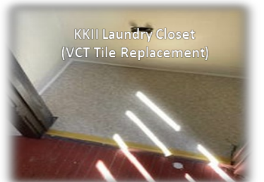
KKII Laundry Closet (VCT Tile Replacement)