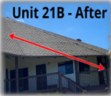
Unit 21B - After

During the resort closure, the essential crew did an amazing job with maintaining the resort and completing numerous projects throughout the property including unit vent clean outs, repainting of the KK II ponds, installation of replacement exterior walkway lighting, power washing throughout the property, etc. Many reserve projects were also done such as KK II pool re-plaster, KK III BBQ grill upgrades, roof repairs and the installation of the KK III pool heating equipment.