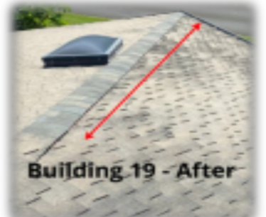
Building 19 - After