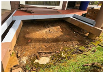
Exterior Wood Repairs (Lanai Decks/Beams)